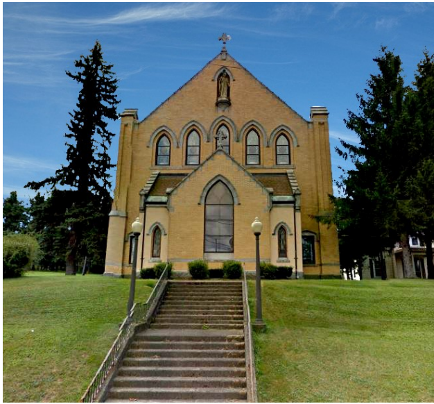
ST JOSEPH CHURCH