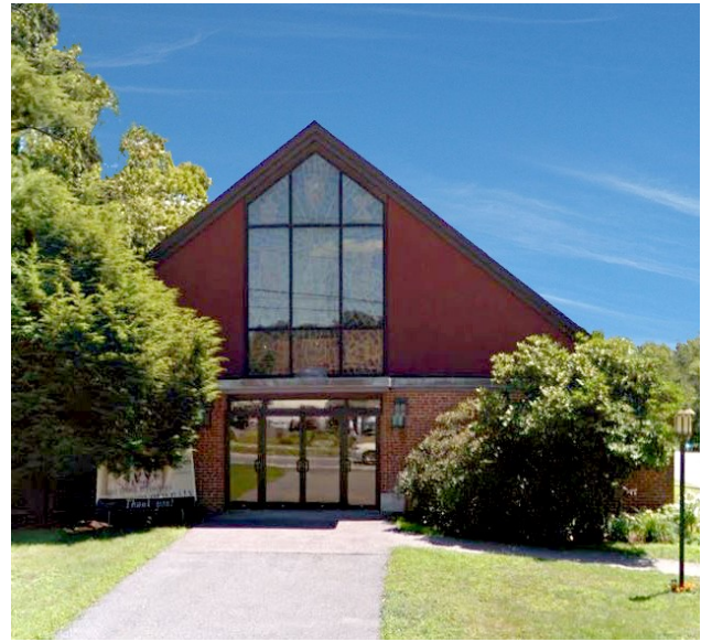
ST PIUS X CHURCH