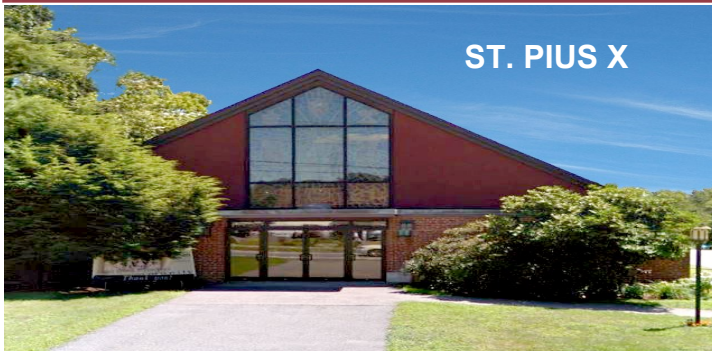
ST. PIUS X